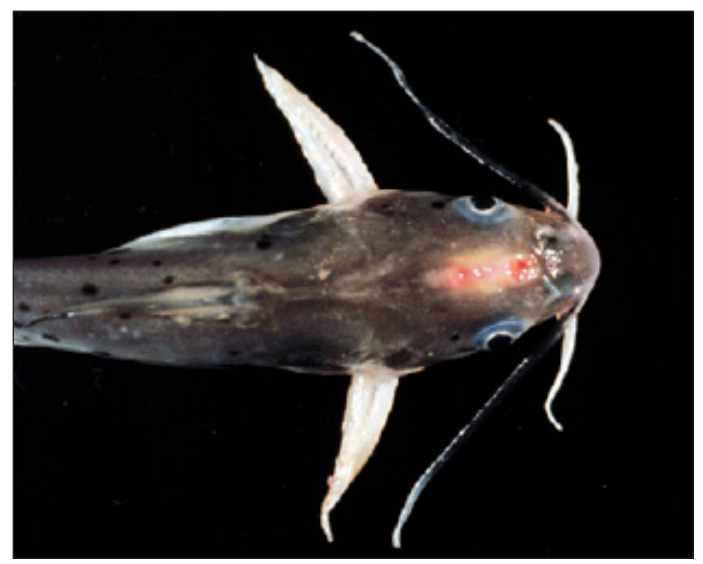
Figure 4. Channel catfish fingerling with chronic ESC showing ulceration of the cranial foramen.