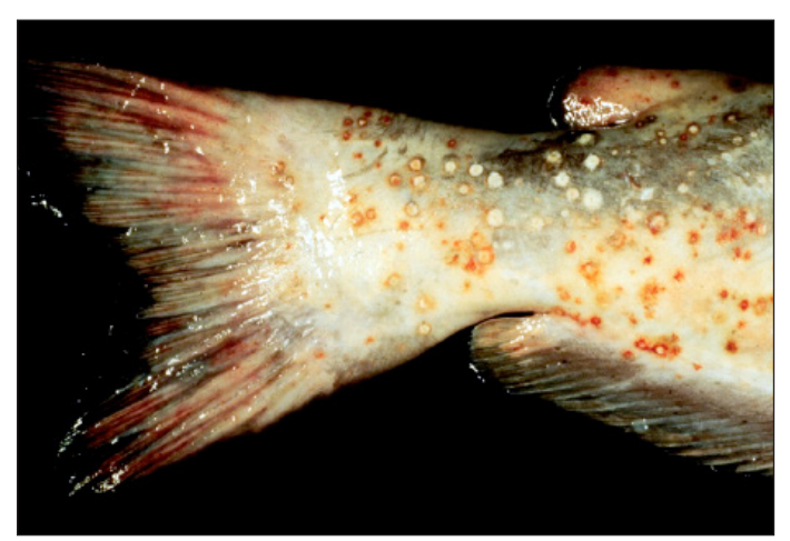
Figure 2. Channel catfish with acute ESC showing small red and white ulcers on the skin.