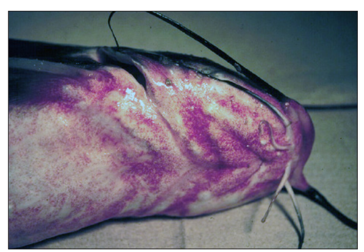
Figure 3. Channel catfish with acute ESC showing petechial hemorrhaging on the ventral surface.