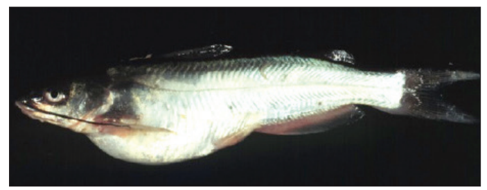
Figure 1. Channel catfish fingerling showing signs of ESC such as distended abdomen and exophthalmia (popeye) due to ascites.

Affected catfish may have internal fluid accumulation (ascites) that can lead to a swollen abdomen and exophthalmia (popeye) (Fig. 1); small red and white ulcers (ranging from pinhead size to about ¼ inch in diameter) covering the skin (Fig. 2); pinpoint red spots (petechial hemorrhage) appearing under the lower jaw or belly region (Fig. 3); and a raised or eroded red ulcer with inflammatory exudate protruding through the cranial foramen at the top of the skull (Fig. 4). The clinical signs seen in Figs. 1, 2, and 3 are more typical of acute infection, whereas the clinical signs in Fig. 4 are more representative of chronic disease.